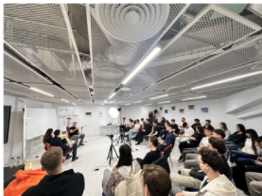
The event on 20th of May 2025 at ASE