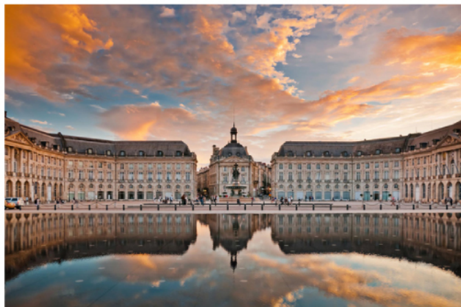
Université de Bordeaux

Upper Austria University of Applied Sciences – Campus Steyr